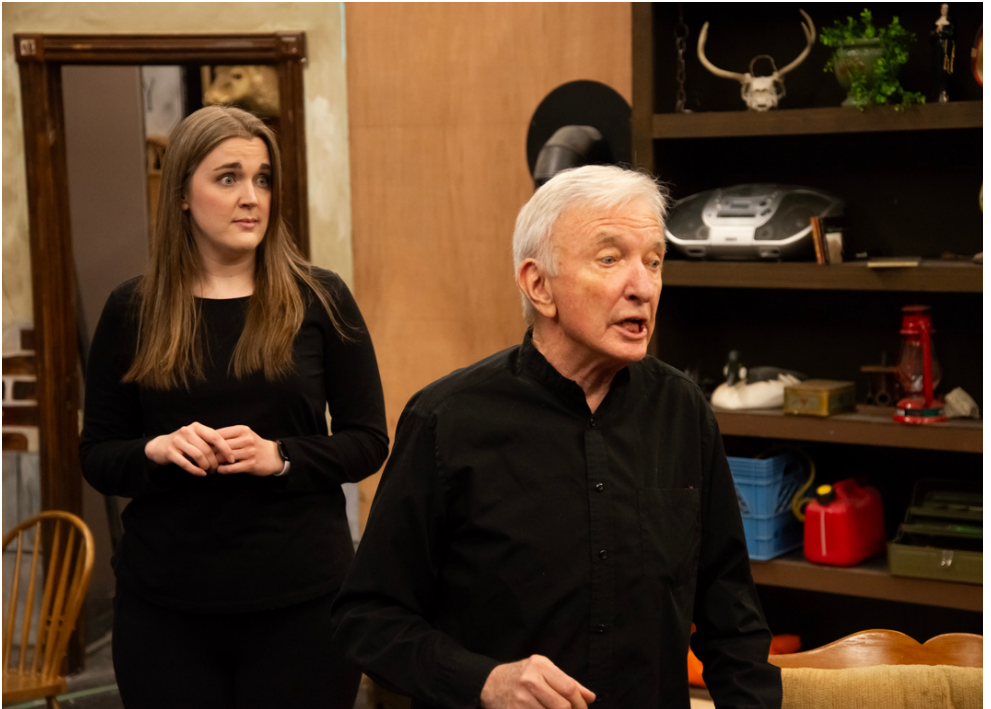
REHEARSAL PHOTOGRAPHY BY NATALIE BAKER